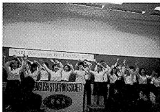
Joint Discussion For Freshmen