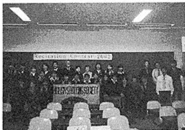
The Recitation Contest