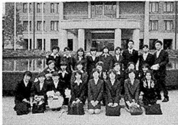
Joint Discussion For Freshmen