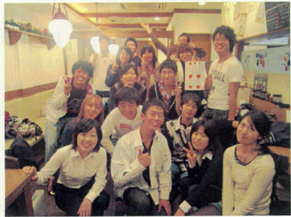
All members in debate section.