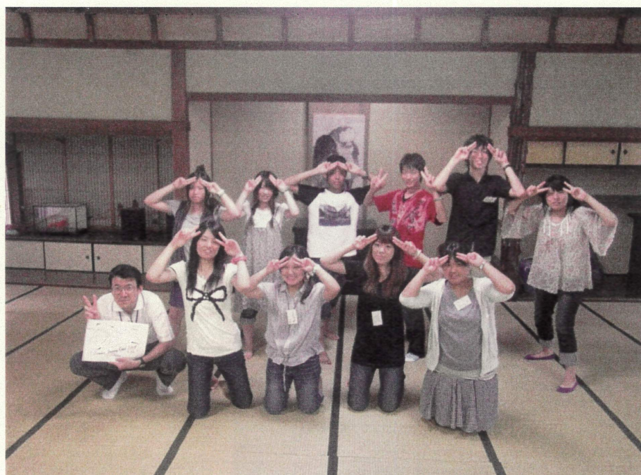
Summer training camp in Ise