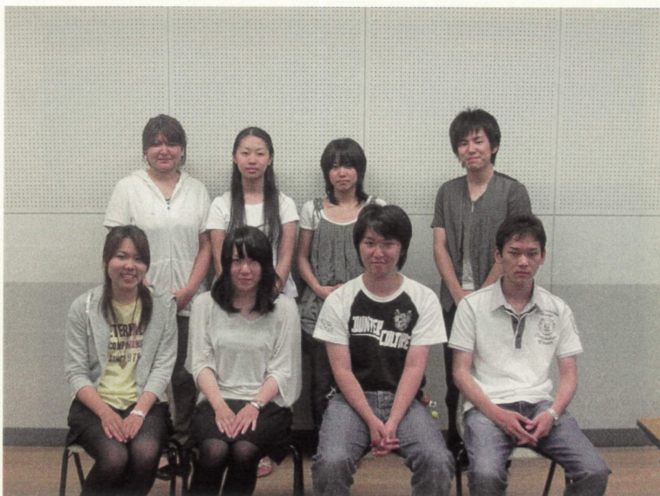
Section members (Junior, Sophomore and freshmen)