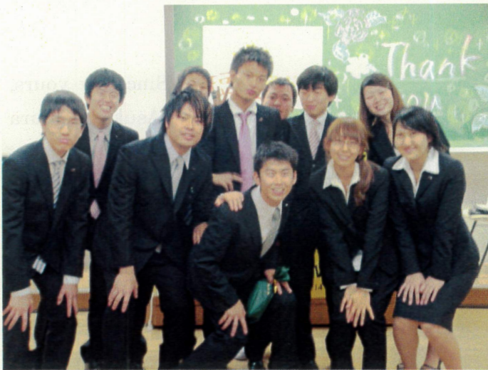
In the party to celebrate college students