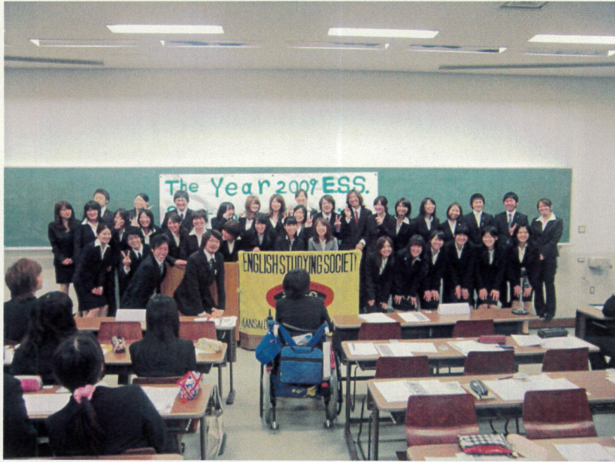
Section Initiation 2009