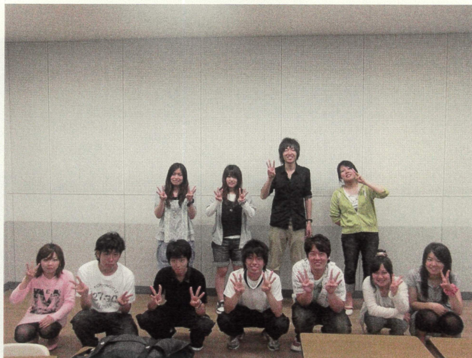
In an activity (Junior, sophomore and freshmen)