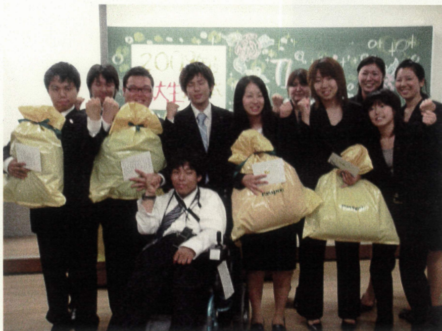
The Party to celebrate the college students