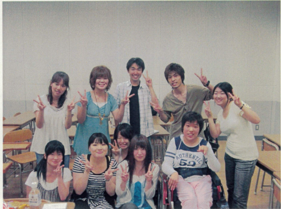
At the party (Senior, sophomore and freshmen )